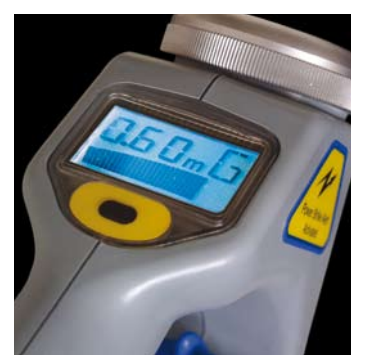
In the G mode the C.A.T<sup>3</sup> detects a tone radiated by the Genny+ to a buried conductor.