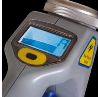
In Avoidance Scan <sup>™</sup> Mode P, R and G operate simultaneously providing faster surveys.