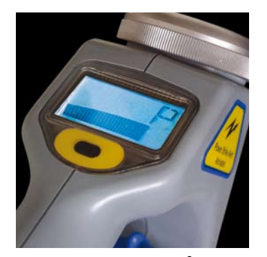
In the P mode the C.A.T<sup>3</sup> detects 'power' signals that are being radiated by loaded cables.