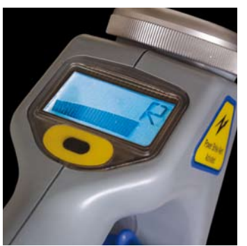
In the R mode the C.A.T<sup>3</sup> detects VLF radio signals re-radiated by buried metallic pipes and cables.